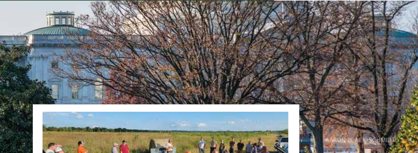
Public access to wild places continues to live within the core of QF's advocacy work.