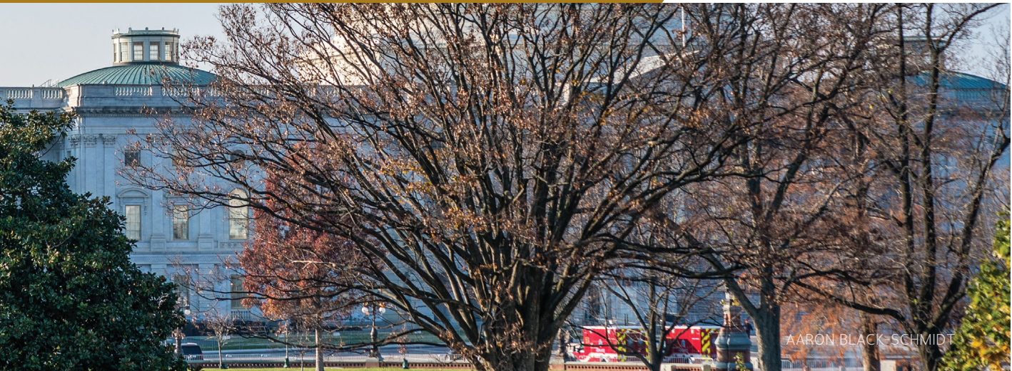
AARON BLACK SCHMIDT