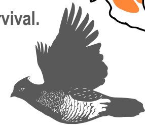
Scaled Quail distribution

What makes good habitat? Having easy access to food, water, cover, and space to support growth and survival.