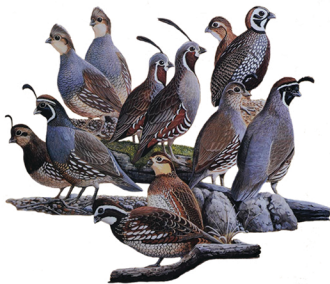
(California, Scaled, Mountain, Mearns’, Gambel’s, and Bobwhite)