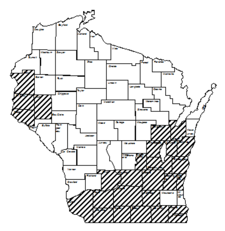
Figure 2. Counties encompassing all or some of Wisconsin's primary pheasant range.